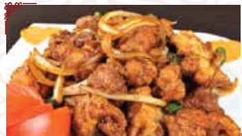
C1 Chili Chicken