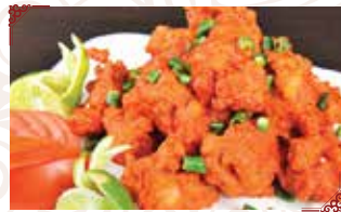
A6 Chicken Pakora