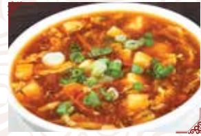
S2 Hot Sour Soup