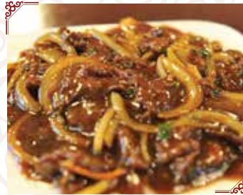
B1 Chili Beef