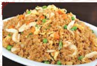
R2 Chicken Fried Rice