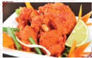
A5 Lollipop Chickens