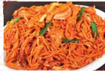
N3 Manchurian Chow Mein