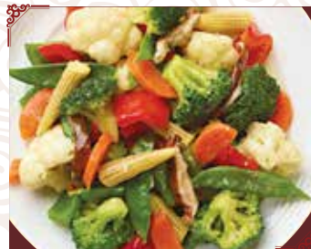
V16 Vegetables Delight