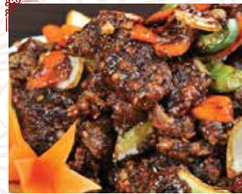
B14 Crispy Beef