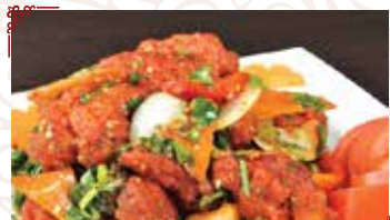
C20 Masala Chicken