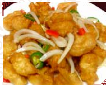
F13 Salt & Pepper Fish