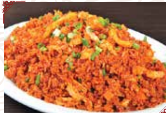
R3 Manchurian Fried Rice