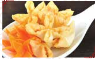
A3 Cheese Wonton