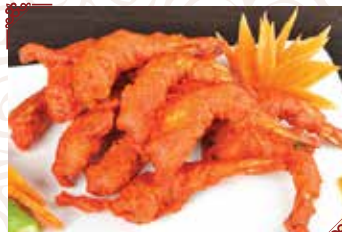
A6 Shrimp Pakora