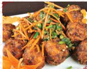
V9 Manchurian Pakora