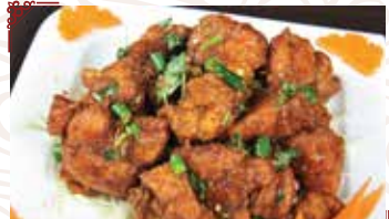
C2 Manchurian Chicken