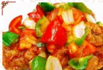
T1 Mango Chicken