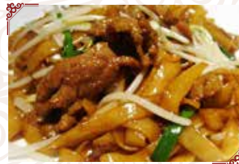
N10 Beef Ho Fen