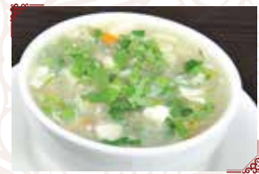
S10 Manchurian Soup