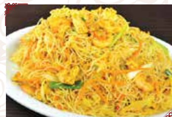
N6 Singapore Rice Thin Noodle