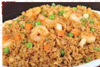
R2 Shrimp Fried Rice